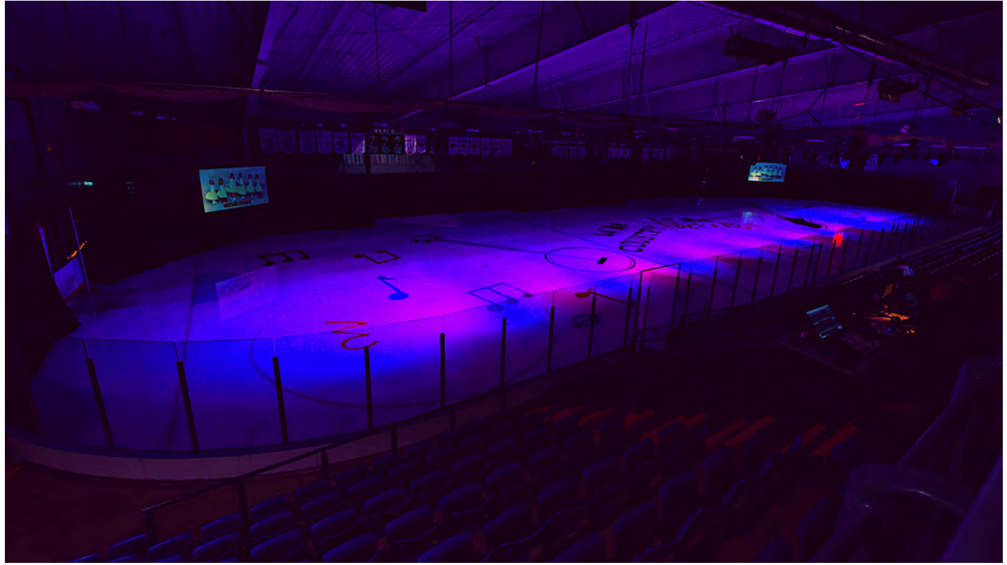
GSC Ice Show set up for "Lil" Bit Country, Lil" Bit Rock & Roll", April 27, 2019

$30 for one show of your choice, or $50 for both shows.